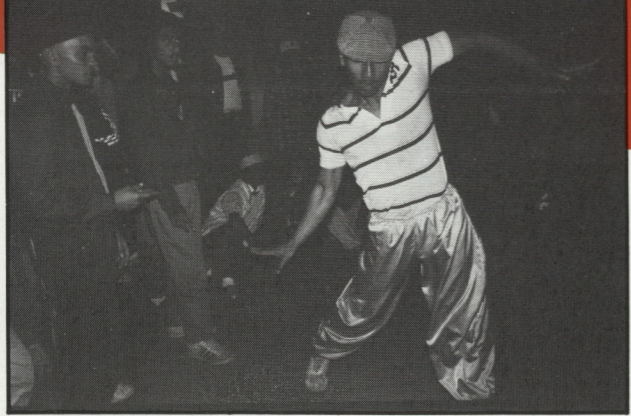
Manners Plaza, Wellington