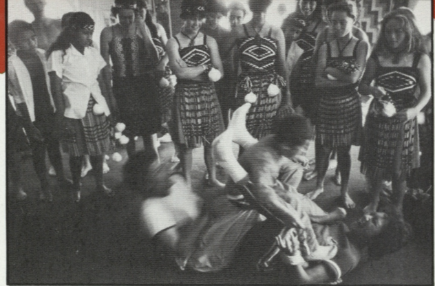
Rutherford High School, Auckland