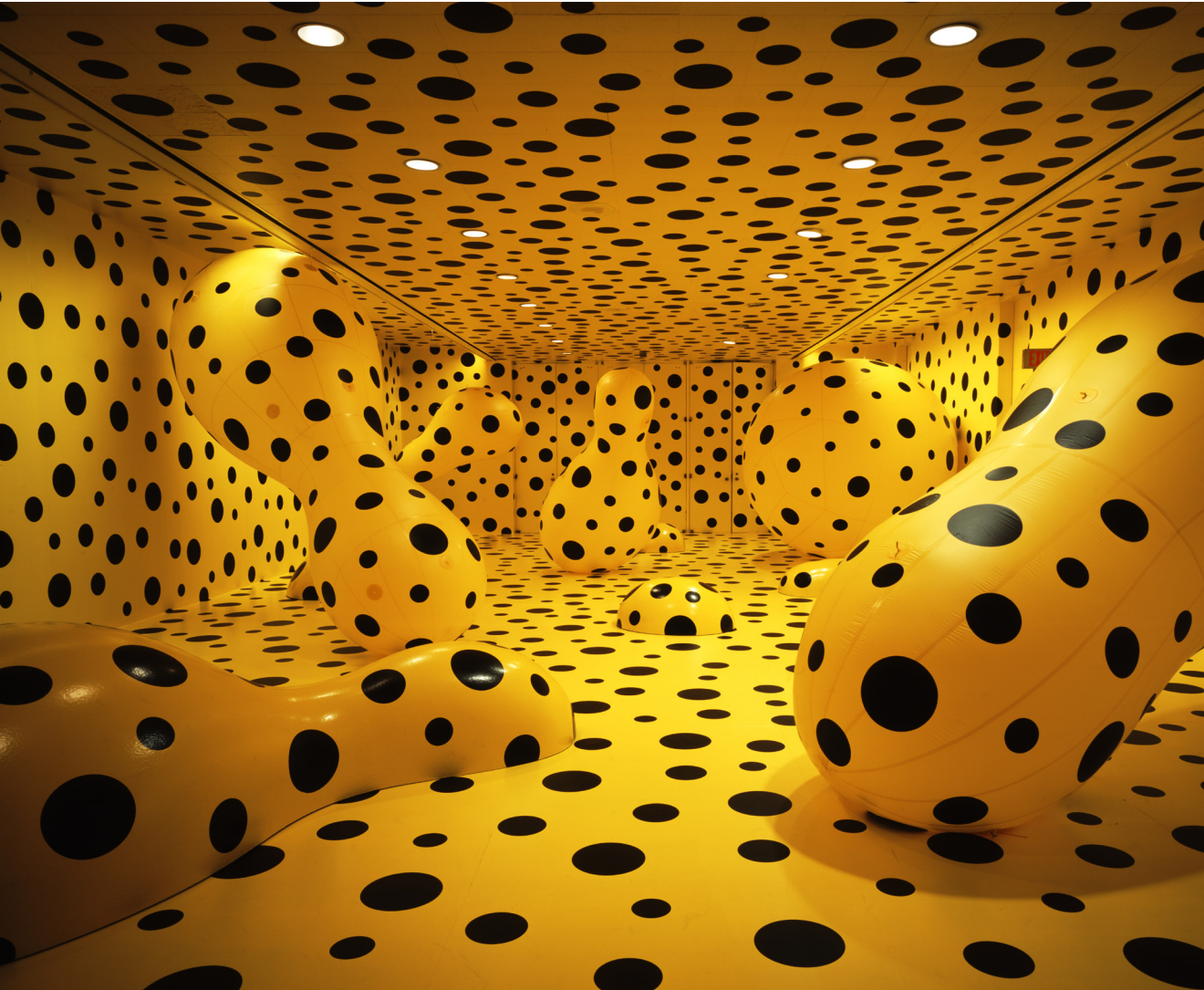
Yayoi Kusama, Dots Obsession-Day, 2008. Installation view: “JAPAN! CULTURE + HYPER CULTURE” at The Kennedy Center, Washington, D.C.

Kusama’s work, idiosyncratic and consistently original, has positioned her as one of the most acclaimed and respected contemporary artists working today.