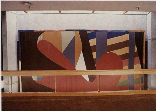
A detail of one of a series of banners commissioned in 1983 for the Michael Fowler Centre, Wellington.