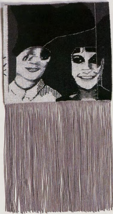
NANYA AND GRUSHA: WOLF-MAN SERIES 1991 Woven tapestry 670 x 525 x 45 mm (framed) Collection: Gill and Errol Howard