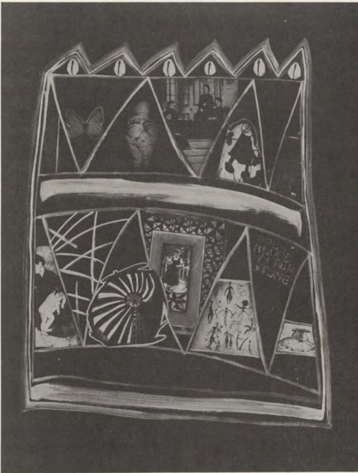
Left: MENARCHE SHIELD FOR BRIGID. Paper photo montage and acrylic on hardboard. 1983