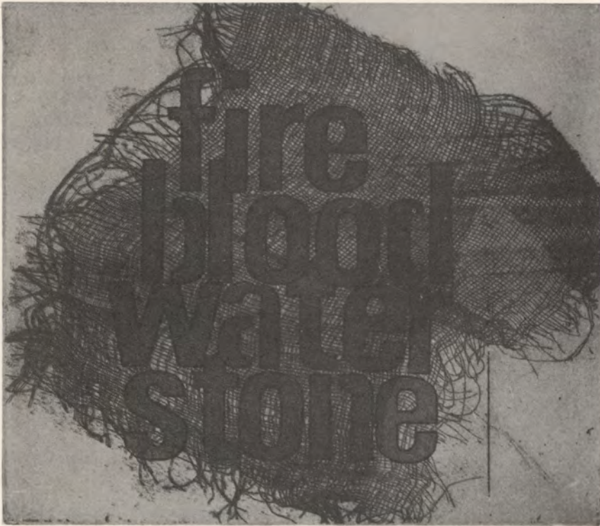
Above: FIRE / BLOOD / WATER / STONE. Etching. 1984