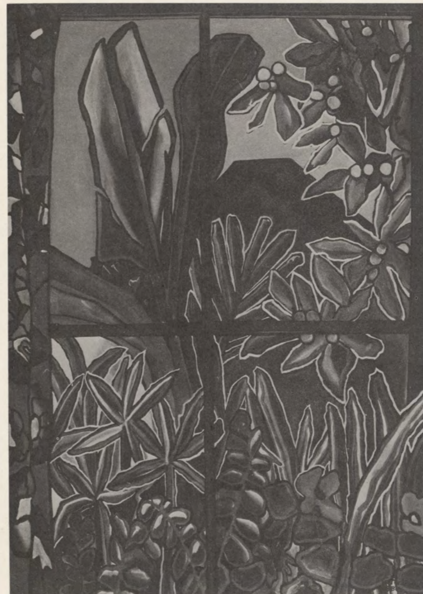
Top: KITCHEN WINDOW. Acrylic on canvas. 1980

1978 Barry Lett Gallery — solo show Travelled to U.S.A., three months