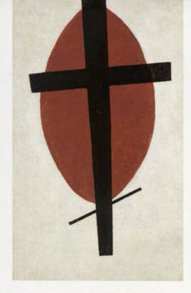
Kazimir Malevich. Suprematism (Black Cross on Red Oval) 1921-27, oil on canvas, 1005 x 600mm