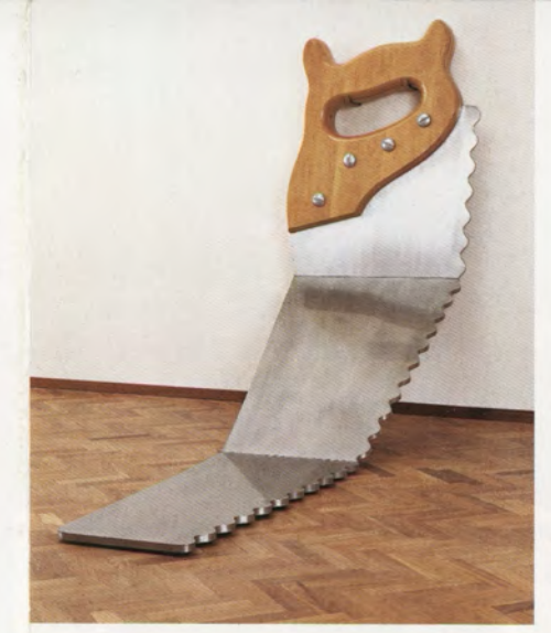
Claes Oldenburg, Saw (Hard Version II), 1971 wood, aluminium 2400 x 1360 x 2670mm Claes Oldenburg, 1971, 1998