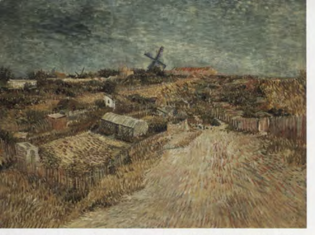
Vincent van Gogh, Kitchen Gardens on Montmartre, Paris 1887, oil on canvas, 960 x 1200mm